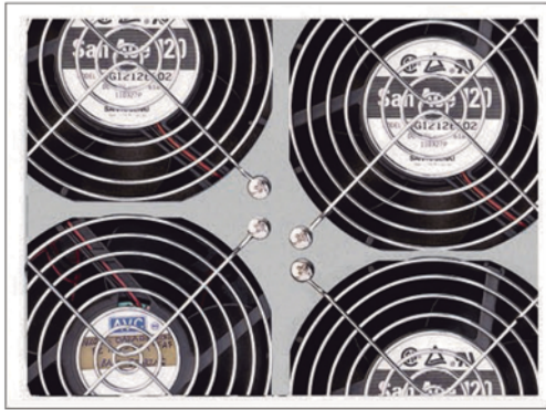
Fan speed controlled by load level