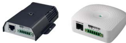
EMD (Environmental Monitoring Device) in order to operate it is necessary to SNMP installed